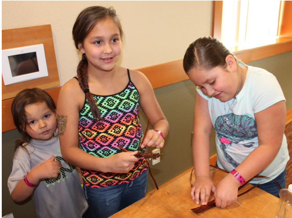
Parents and Children Weaving with Cedar Bark