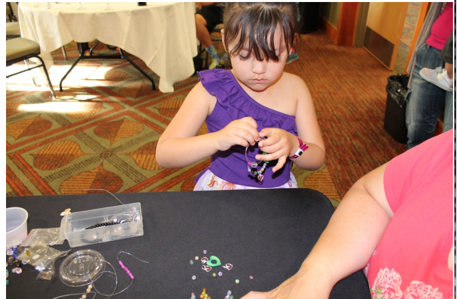
Families doing Beadwork