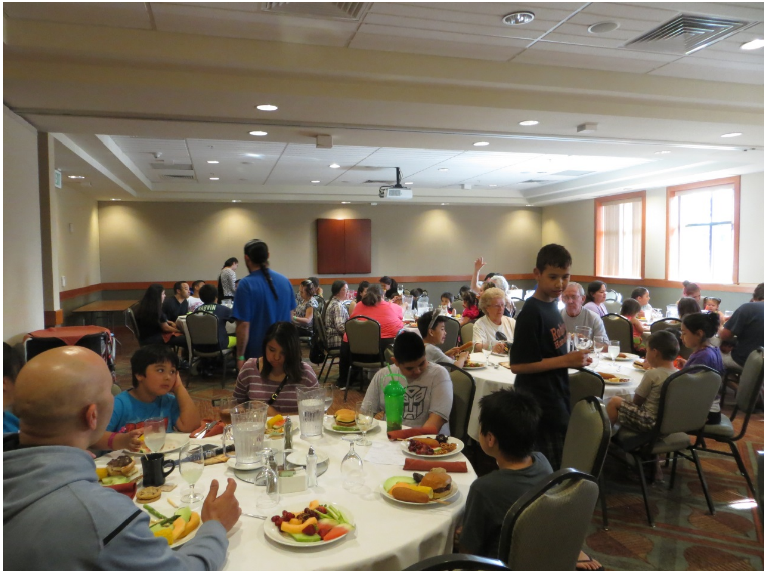
Children and Families Enjoying a Meal Together