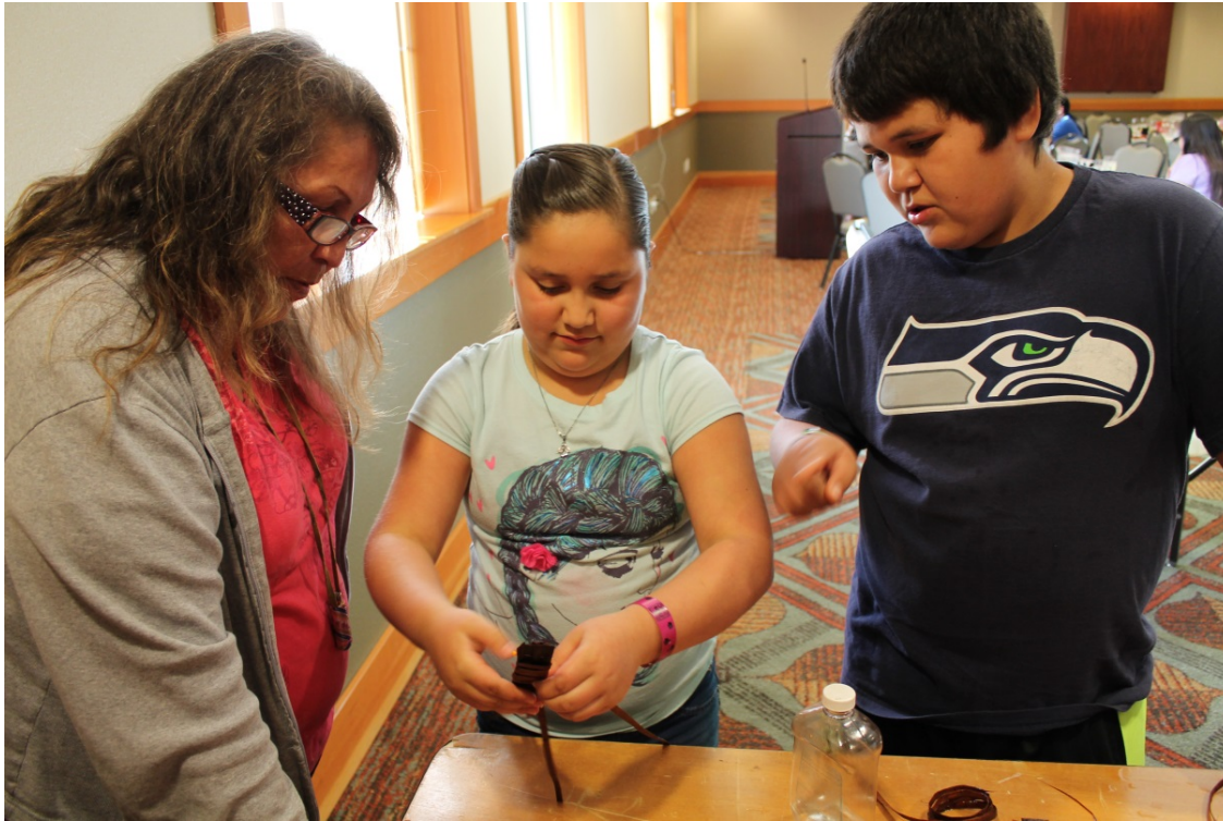
Lummi Elder teaching children to weave with cedar bark