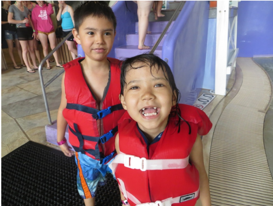
Children having fun in the Water Park

Participants in the 7 am Parent Support Group